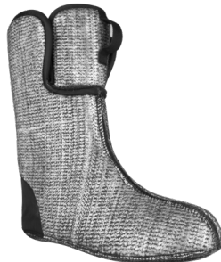
REMOVABLE FELT LINER (S22080 B11) INCLUDED WITH THE BOOT.