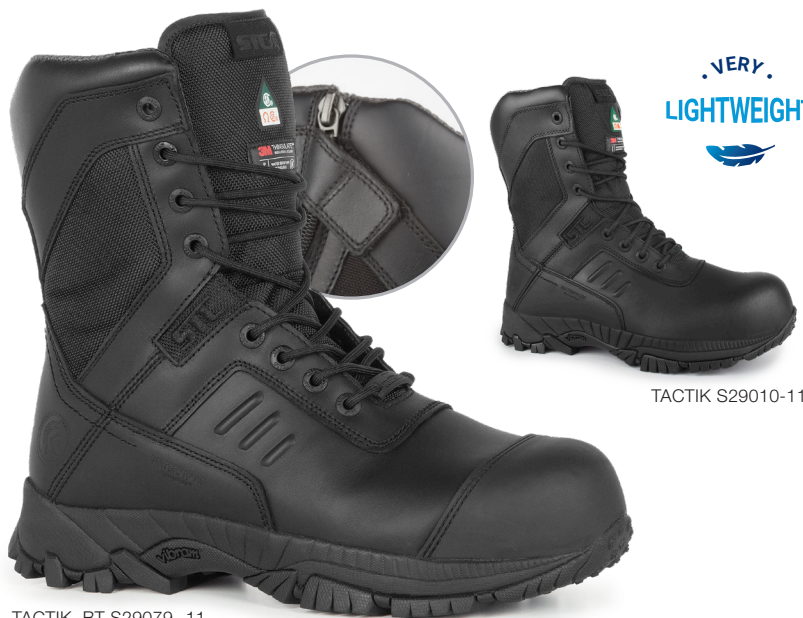
TACTIK BT S29079 -11